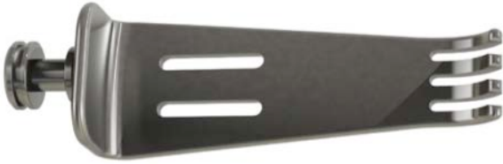
Blade with Teeth Stainless Steel