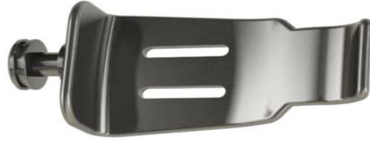
Depth Blade Blunt Stainless Steel