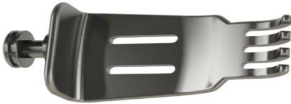
Depth Blade with Teeth Stainless Steel