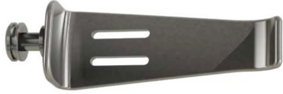
Blade Blunt Stainless Steel